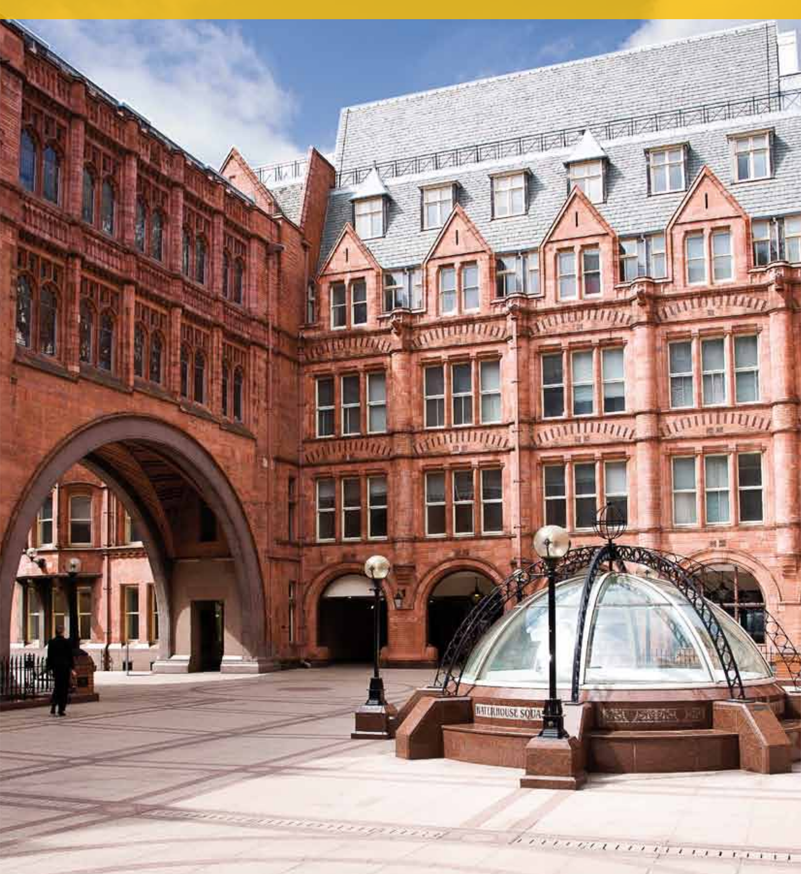
Piazza view of Waterhouse Square

Refurbished Ground Floor Offices To Let 2,182-7,939 sq ft